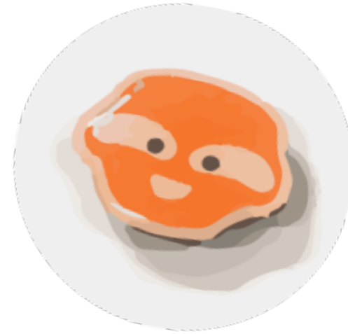
“Big Waster” Badge