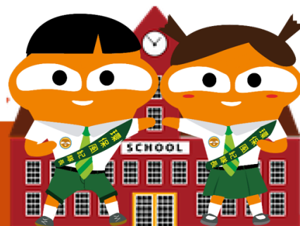
Head GP (1-2 no. each school)