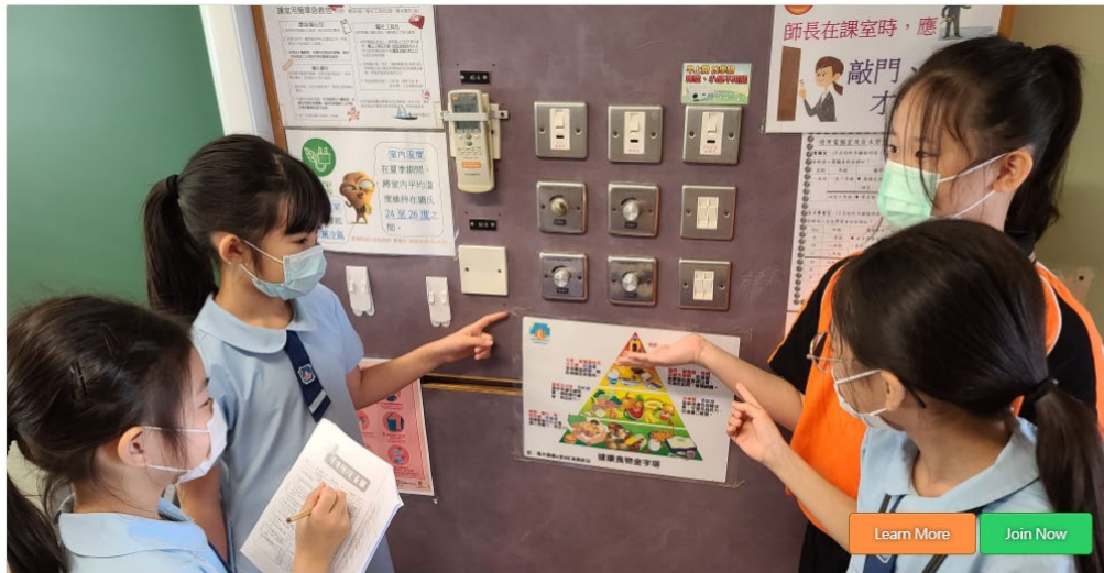
About the Programme