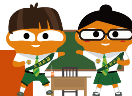
School GP (1-2 no. each class)